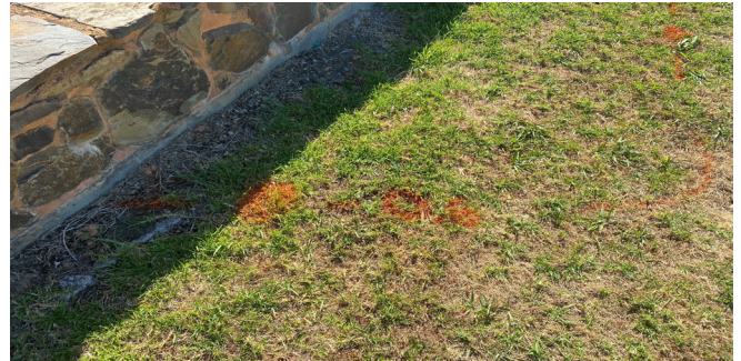
DISCRETE UTILITY MARK UP

Our spatial data will inform the design of future infrastructure, provide a single point of truth for design consultants, and aid the preparation of construction documentation.